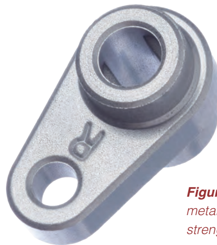
Figure 3. Sinter hardened metal increased the yield strength of an appliance cam from 50 to 120 ksi.

In addition to geometry and cost, a sinter hardened material is preferred in this instance because the part does not require a burn-off cycle in preparation for the plating process. The cam design is similar to an earlier component produced in a common iron copper alloy.