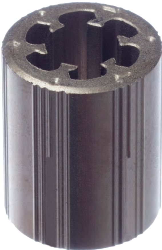
Figure 4. Thanks to sinter hardening, a small cylindrical housing with intricate interior features is mass produced cost-effectively.

The housing requires a ribbed flange die to create the fine detail on the component's exterior. There, the die has a fixed-fill feature that creates a ribbed pattern on the outside diameter, which serves as a visual aid to orient the part for the assembly process. On the interior, the core pin creates all the interior vein details.